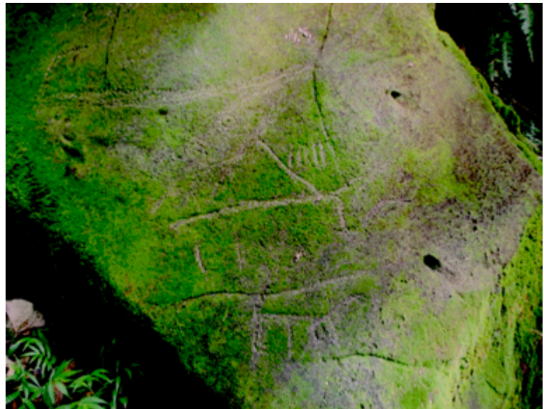
Dog petroglyphs at Kahuvai, Nuku Hiva

Our team registered petroglyphs in the remote western part of Hatiheu valley, known as Kahuvai. We photographed petroglyph panel H15 in site 331, which depicts several fish figures with 1-4 cupules on their backs depending on the size of the figure. A carved dog appears in the same panel. Two more dog petroglyphs were recorded in a nearby panel, as well as other fish figures. Dog motifs have also been recorded on Ua Huka and Hiva Oa, but are