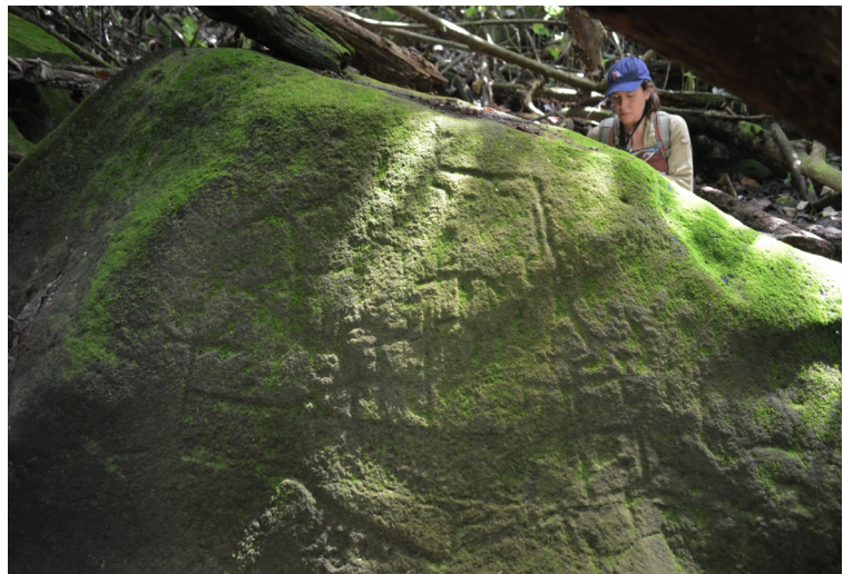
Team member Alexandra Edwards recording petroglyphs on a boulder with geometrical motifs at Kahuvai, Nuku Hiva

Although petroglyphs are found in all of the above-mentioned contexts, most of them are located around major waterways in the most fertile part of valleys. The largest concentration of rock art is directly associated with ceremonial structures. When petroglyphs are carved on large boulders, usually the biggest one in the site was chosen and several sides of the stone were carved. A few large boulders however, may only contain one small figure in a corner of the rock. Superimposition, though relatively uncommon, is present and may have a panel richly carved with a myriad of figures. Overlapped carvings often give us an indication of how styles change over time. Interestingly, an overwhelming majority of rock art panels in Hatiheu face north and towards the ocean, although according to ethnographic sources there was no name for a northern direction in the Marquesas, nor did it have any special meaning.