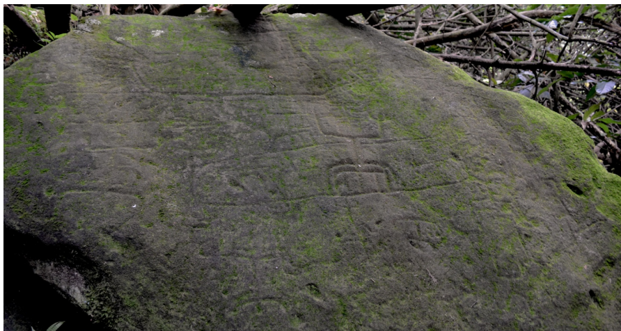
Geometric motifs on a boulder at Kahuvai, Nuku Hiva