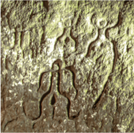
Human figures at Kamuihei