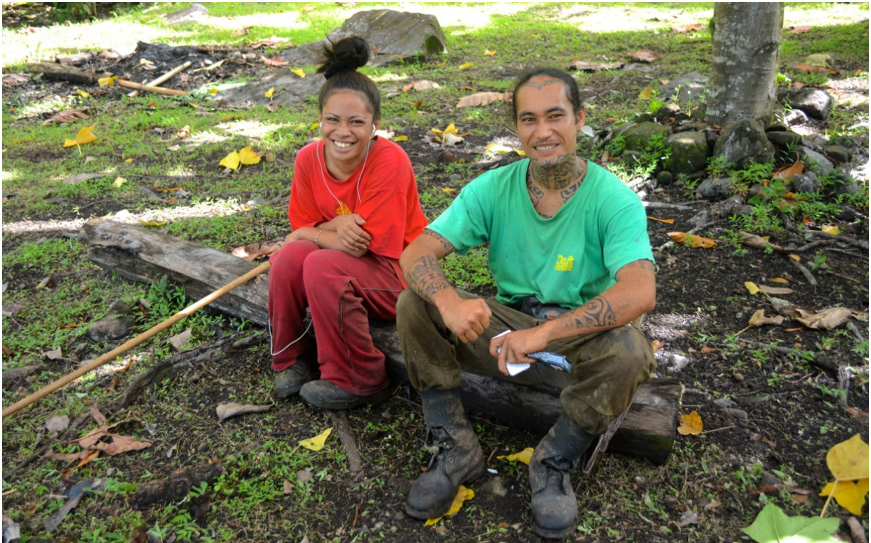
Marquesan youths at Tohua Koueva, Taiohae, Nuku Hiva

Of all the diseases that arrived to the Marquesas, the most deadly was smallpox, which arrived in 1864, when Peruvian blackbirders knowingly repatriated three Marquesan men who had previously been kidnapped and infected in the port of Callao before being returned home. The epidemic spread quickly with dear consequences for the local populations. According to missionaries settled in the Northern Marquesas, this disease killed 60-70% of the local population, while some settlements, such as Hatu Atua and Anaho in Nuku Hiva, were completely depopulated. In addition, cannibalism and inter-tribal warfare continued until nearly the 1870s in some remote valleys, leading to a rapid decrease in population. Furthermore, Chinese workers who were brought to work in European vanilla and copra plantations introduced opium to the islands, and many Marquesas became addicted to its use. By the 1900s Marquesans seemed to be in danger of extinction. Fortunately, this did not happen. Present-day Marquesans feel very proud of their heritage, history, and traditions and have formed several cultural organizations dedicated to the preservation, enrichment, and diffusion of Marquesan culture, which is very much alive in all of the Marquesas today.