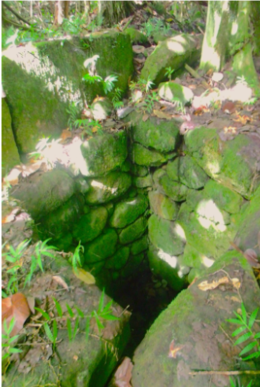
Taro pit, near Kahuvai, Nuku Hiva

Cultural and linguistic evidence indicate that the first settlers of the Marquesas