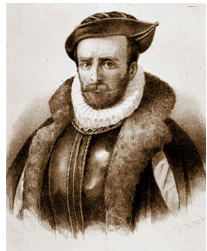
Portrait of Alvaro de Mendaña

Spanish Captain Alvaro de Mendaña was the first Westerner to record the existence of the Southern Marquesas, arriving to Fatu Hiva in 1595. Mendaña named the island group the “Islas de Marquesas” in honor of the wife of his patron Don Garcia Hurtado de Mendoza, the Viceroy of Spain in Peru. This first contact was very violent with several hundreds of Marquesans being killed by the Spanish. The islands remained undisturbed for hundreds of years until Captain James Cook visited the Southern Marquesas in 1775, while the Northern Marquesas were not discovered until 1791 by American Captain Joseph Ingraham on board a whaling ship. Ingraham named the group the Washington Islands and claimed them for the United States, but this was never ratified. However, this led American Naval Captain David Porter to try and reclaim the Northern Marquesas while at war with the British in 1813. Porter built a settlement and fort called Madisonville, on Nuku Hiva. This little-known episode of American history is the subject of a short mini-documentary we shot at Nuku Hiva as a corollary to our expedition and will be discussed in greater detail later in this report. Other famous visitors to the Marquesas are Herman Melville, Robert Louis Stevenson, Paul Gauguin, Jack London, and Jacques Brel, all of whom recorded the traditional way of life.