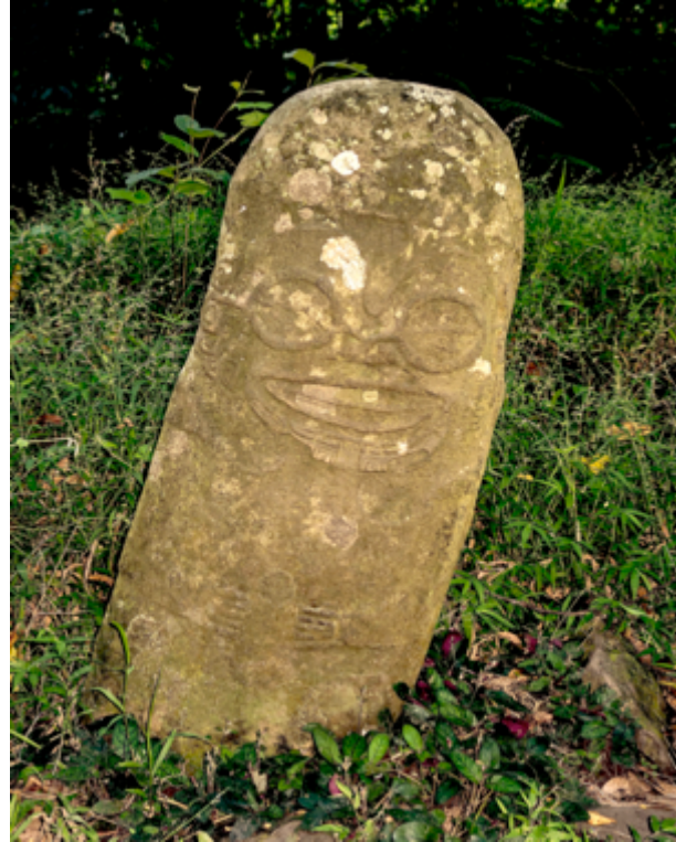
Remote tiki between Aakapa and Hatiheu, NH

Marquesan statues also usually have a broad flat nose with nostrils that fill out most of the center of the face. A long, wide, and oval mouth, sometimes with a protruding tongue, covers the lower part of the face. Many of the images have geometric tattoo designs finely incised on the sides of the mouth, chest, or on the thighs. Breasts and nipples are not to be missed, and the back of the figure often has a spine and buttocks carved on it, regardless of the placement of the statue. Some of the images have the arms separated from the torso, while on others the arms are hardly indicated. Hands with fingers are sometimes placed stretching across a protruding abdomen, the seat of ritual knowledge. Little detail is apparent on the legs, which are usually stubby and flexed below a wide pair of hips, if they appear at all. Circular knobs sometimes represent ankles and a few of the images have toes. Many Marquesan statues are secured into the ground by a long projection. Sizes vary between 0.14-2.5 meters above the ground. Each statue was named after the deified chiefs/chiefs or inspirational priests/priestess they represented. Few of the names however, are remembered today.