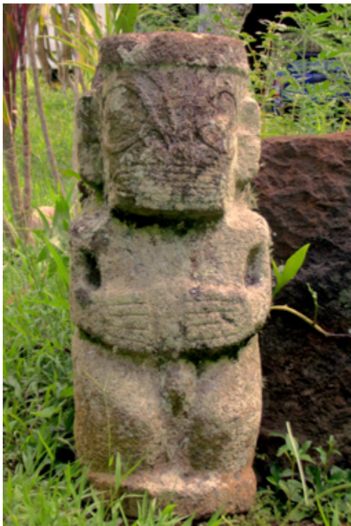
Detail of a tiki in Puamau, Hiva Oa

known for the development of large megalithic stone structures, carved images, and rectangular cut slabs of red tuff, which were placed on top of the terraced platforms of chiefs and important priests as signs of prestige. Often these slabs would depict one or a couple of naturalistic-looking human figures in bas relief.