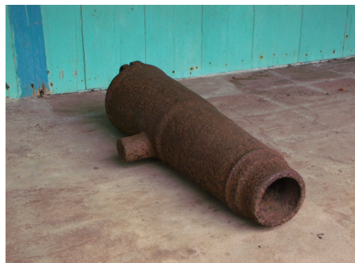
The Porter Expedition cannon, hauled up to Taipivai in November 1813 by Porter and his men.

The Te I'i and Hapa'a warriors began to turn on the Americans soon after the defeat, leading Porter to fear for Madisonville. In order to prove his authority, Porter led most of his men and a few Te I'i on an overland nighttime hike up to Taipivai, the heartland of the Taipi settlements. The attack had to be postponed since the following day was rainy and moisture had temporarily ruined the gunpowder. The attack began on November 30 th , and this time despite another ambush the Americans and Te I'i subdued the Taipi who after ignoring a message warning them of the consequences of not calling a ceasefire, had several of their settlements burnt. Taipi emissaries were sent soon after, carrying "countless" hogs as a peace offering.