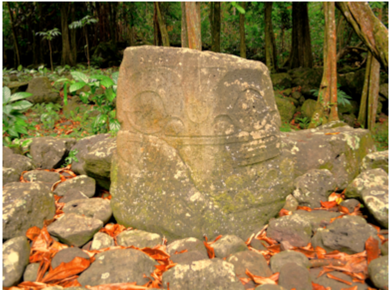
Tiki on a tohua at Taaoa Valley, Hiva Oa

Sculptured stone images called tiki (which today refer to any depiction of a human figure on stone, wood, on cloth, and as tattoo) probably evolved from the tradition of engraving anthropomorphic figures on rocks and carved wooden pillars for houses and other structures. Most of the images are located or associated with structures that have been dated to the Expansion (AD. 1100-1400) or Classic period (A. D. 1400-1790). The Classic period is