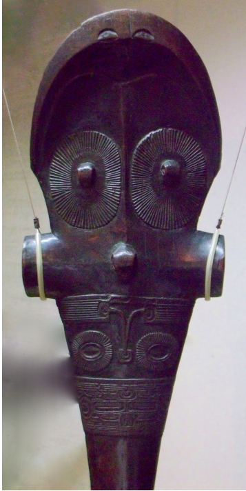
Marquesan war club