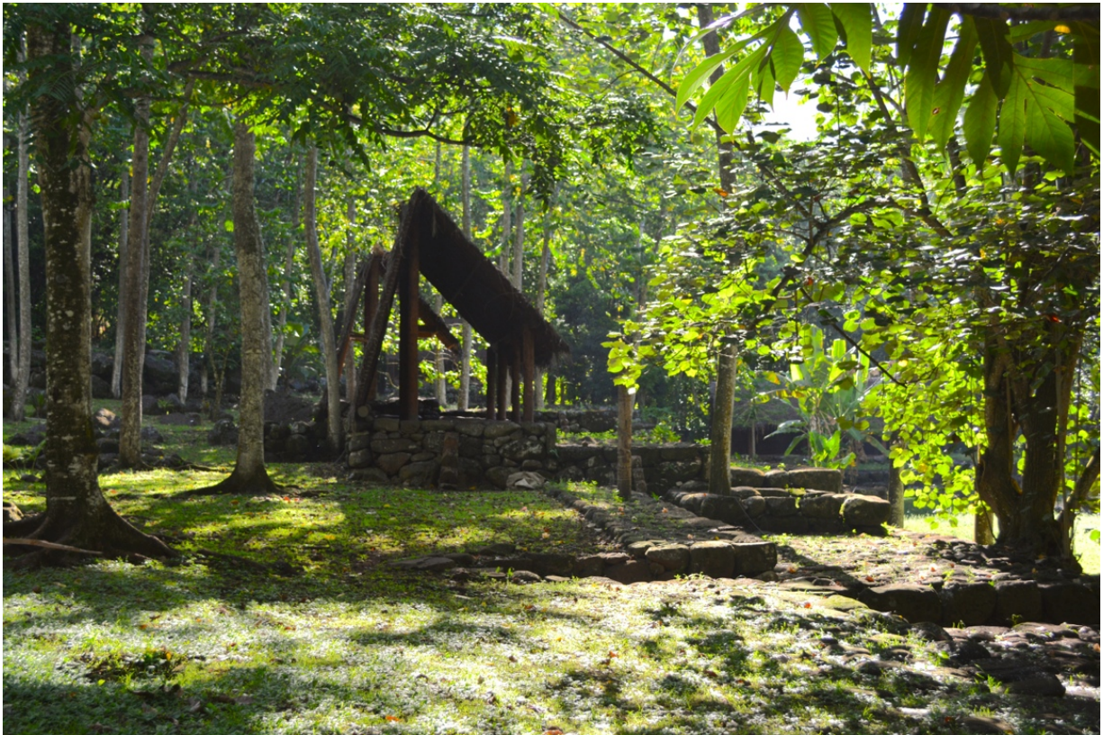
Tohua Kamuiheu, Nuku Hiva

The ancient Marquesans had a special relationship with the environment. Rocks, like all things in nature, were believed to grow the same as people and plants. Oral traditions and chants relate how the first stage of cosmic evolution was the growth of papa (rocks). Stone was considered the best media to represent supernatural beings such as gods and deified ancestral spirits, and were often considered to be the dwelling places of supernatural entities. Stone carving was so important that certain rituals were observed when quarrying stone, and carving activities were accompanied by special chants and ritualistic observances. Stone and wood carvings were carved by trained specialists called tuhuna ta'ai tiki (image makers) however, not all petroglyphs display the same fine carving techniques.