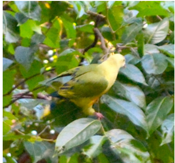
White-capped fruit dove

Like most volcanic islands, the original flora of the island arrived by flotation and wind-dispersal in addition to in the beaks, feathers, and guts of vagrant birds. Although the Marquesas have a diverse marine fauna, the islands are not protected by coral reefs, thus they have fewer marine species than their neighbors, the Society and Tuamotu Islands. The terrestrial fauna of the Marquesas is mostly limited to birds, many of which are endemic. In fact, 42% of the plants and animals found in the Marquesas are natural to the islands. Our team was fortunate enough to observe and photograph the white-capped fruit dove ( Ptilinopus dupetithouarsii ), one of eight birds endemic to the Marquesas (pictured above). Unfortunately, 18 of the 26 birds endemic to French Polynesia are in danger of extinction as a result of predation, disease, habitat changes, and unregulated hunting in past times. In relation to the number of native species, land area, and population size, this is the highest number of endangered birds in the world.