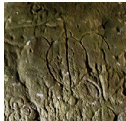
Turtle petroglyph at Kamuihei