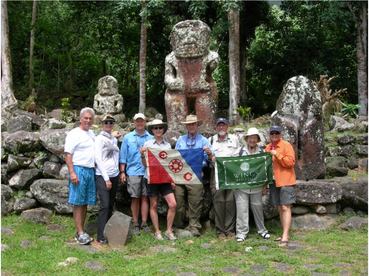
Explorers Club Flag #83 and Wings Flag #25 Expedition team 2013 at Me'ae Oipona on Hiva Oa

Funded by The Pacific Islands Research Institute (PIRI) and private donations Expedition Team