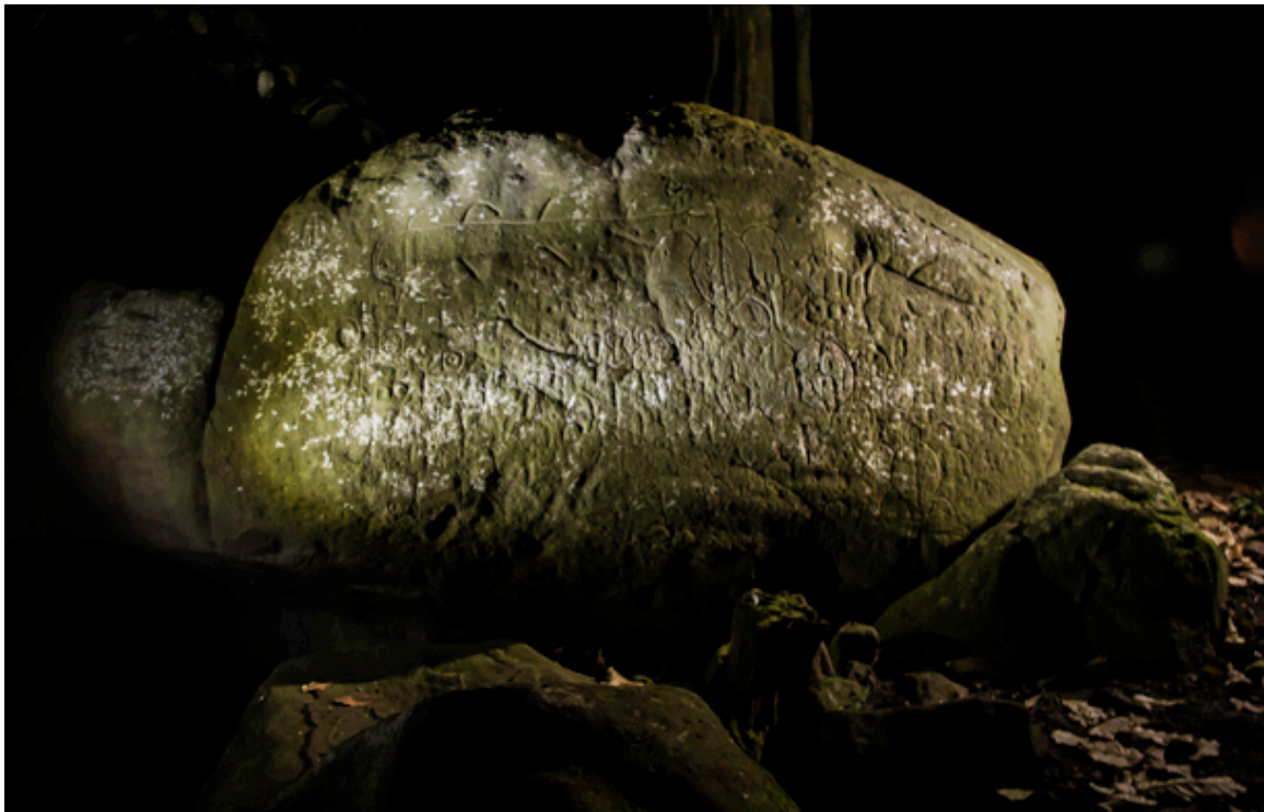
Light-painted petroglyphs on a boulder at Tohua Kamuihei, Nuku Hiva

The accumulated rock art inventory from the Marquesas Islands exhibit a sophisticated and rich carving tradition. Petroglyphs, which are by far the most common form of aboriginal rock art, have been recorded on all the islands that have been archaeologically surveyed. Possibly due to a higher concentration of work being carried out on Nuku Hiva, most of the sites have been registered there. Our team recorded petroglyphs at Tohua Kamuihei by light-painting them at night, which accentuates the many figures carved on the stones.