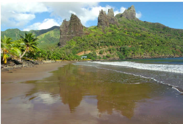
Hatiheu coastline, Nuku Hiva

(Phase I) The Marquesas Islands, named “Te Henua Enata” or “The Land of Men” by their Polynesian discoverers, are located approximately 1,370 km northeast of Tahiti and 4,800 km west of Mexico. Although they are part of French Polynesia, geographically they are one of the most remote island groups in the world and the most distant from any continental land mass. The archipelago is formed by a string of islands that extends about 230 miles from northeast to southeast and is located 8°-11° South latitude and between 138°-141° West longitude. The archipelago is divided into two distinct separate island groups. The Northern group is comprised by Nuku Hiva, Ua Pou, Ua Huka, and the two uninhabited islands of Ei’ao and Hatutu. Hiva Oa, Tahuata, Fatu Hiva, and uninhabited Fatu Huku and Motane form the Southern group. The total land area is about 1,050 km 2 with a population of approximately 9,000 inhabitants with a similar number of Marquesans living in Tahiti. Our Expedition was circumscribed to working in the two largest islands of each group, Hiva Oa and Nuku Hiva, in the Southern and Northern groups respectively. Nuku Hiva is also home to Taiohae, the administrative capital of the Marquesas.