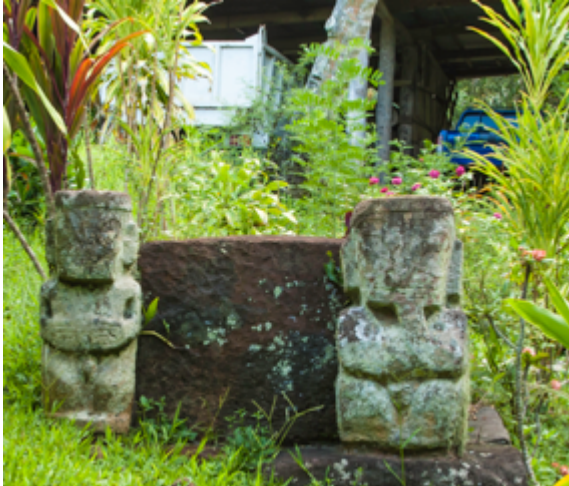
Tiki on a tomb on private property, Hiva Oa

Due to difficulties associated with transportation to isolated valleys, environment, climatic condition, and the high cost of conducting research on these islands, different field methods have been used and modified in order to improve recording speed and accuracy. Since the sites had all been duly registered in written form and properly mapped, our aim was to digitally photograph as many petroglyphs as possible since the only existing complete photographic record of these sites disappeared in a fire in the late 1990s. The idea is to ultimately process the photographs with digital imaging