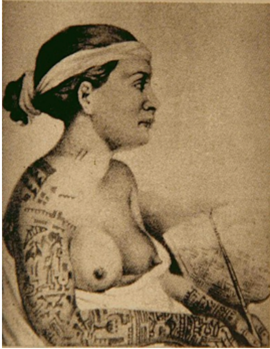
Queen Paetini of Taiohae, Nuku Hiva (Portrait by the art staff of Adm. Dumont d'Urville)